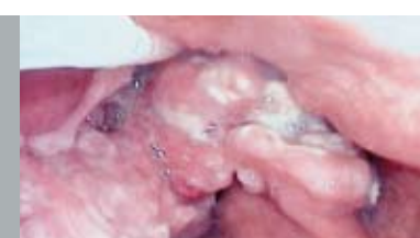
Piriform Fossa Carcinoma