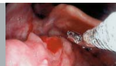
Biopsy of a Base of the Tongue Cancer