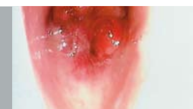
Suglottic invasion by thyroid carcinoma.