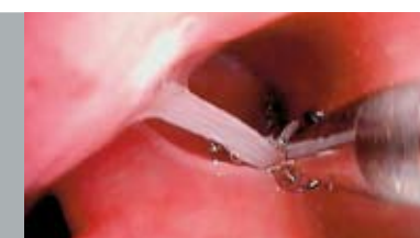
Removal of Fish bone from the Piriform Fossa