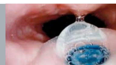
Speech Prosthesis in-situ in oesophagus