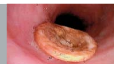
Speech Prosthesis with fungal colonisation