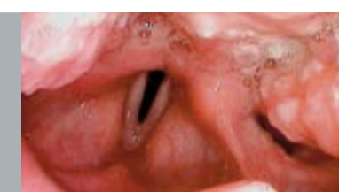
Posterior Pharyngeal Wall Cancer