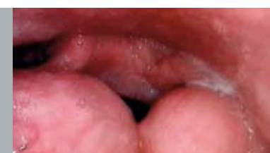
Bilateral internal laryngocoeles