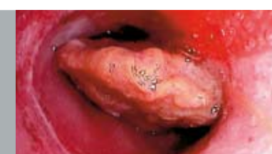
Plumb stone in Oesophagus