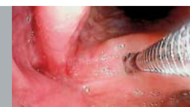
Biopsy of vocal cord under LA