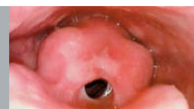
Supraglottic cicatrising pemphigoid of larynx