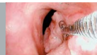
Biopsy of a laryngeal cancer under LA