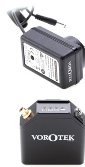
Power Pack & Charger